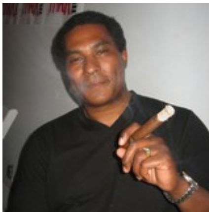
A Taste of the Caribe is a fundraiser to benefit the International Children’s Heart Foundation.